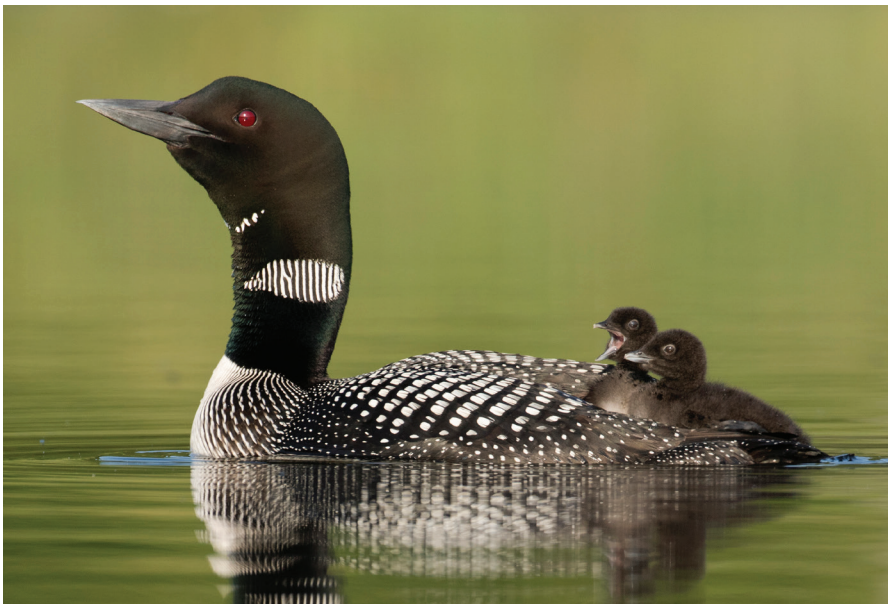
Common Loon