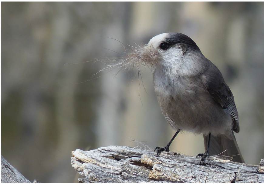
Canada Jay