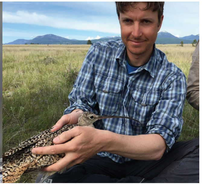
Long-billed Curlew