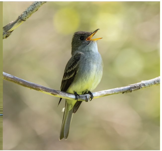
Eastern Wood Pewee